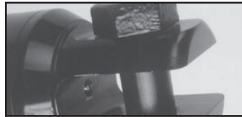
Figure 1. Grease-Zerk